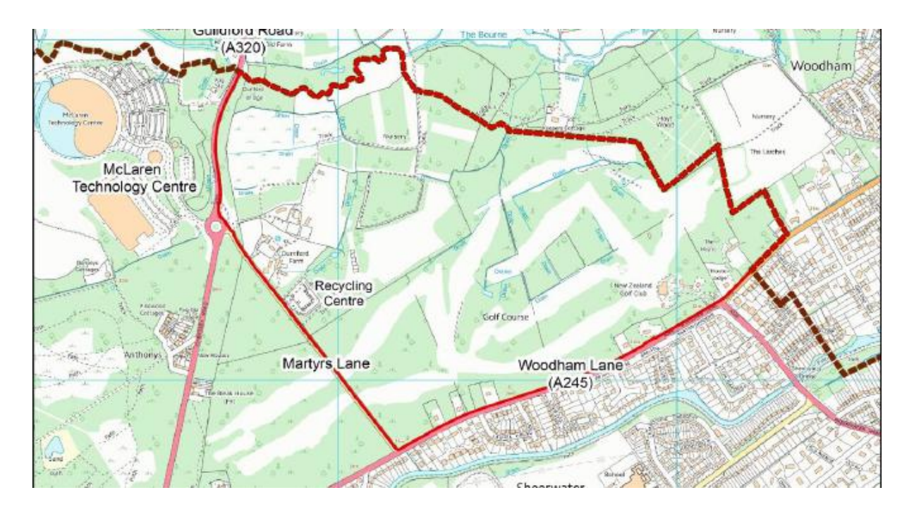
The Proposed Site East of Martyrs Lane

A number of councillors, perhaps realising that the SADPD would be vulnerable to legal challenge unless a wider range of options was considered, identified a new site east of Martyrs Lane that had not previously been given serious consideration. This option was put before a full Council Meeting in October 2016. The proposal was for a replacement SADPD that included consideration of the Martyrs Lane site to be prepared for a second round of public consultation.